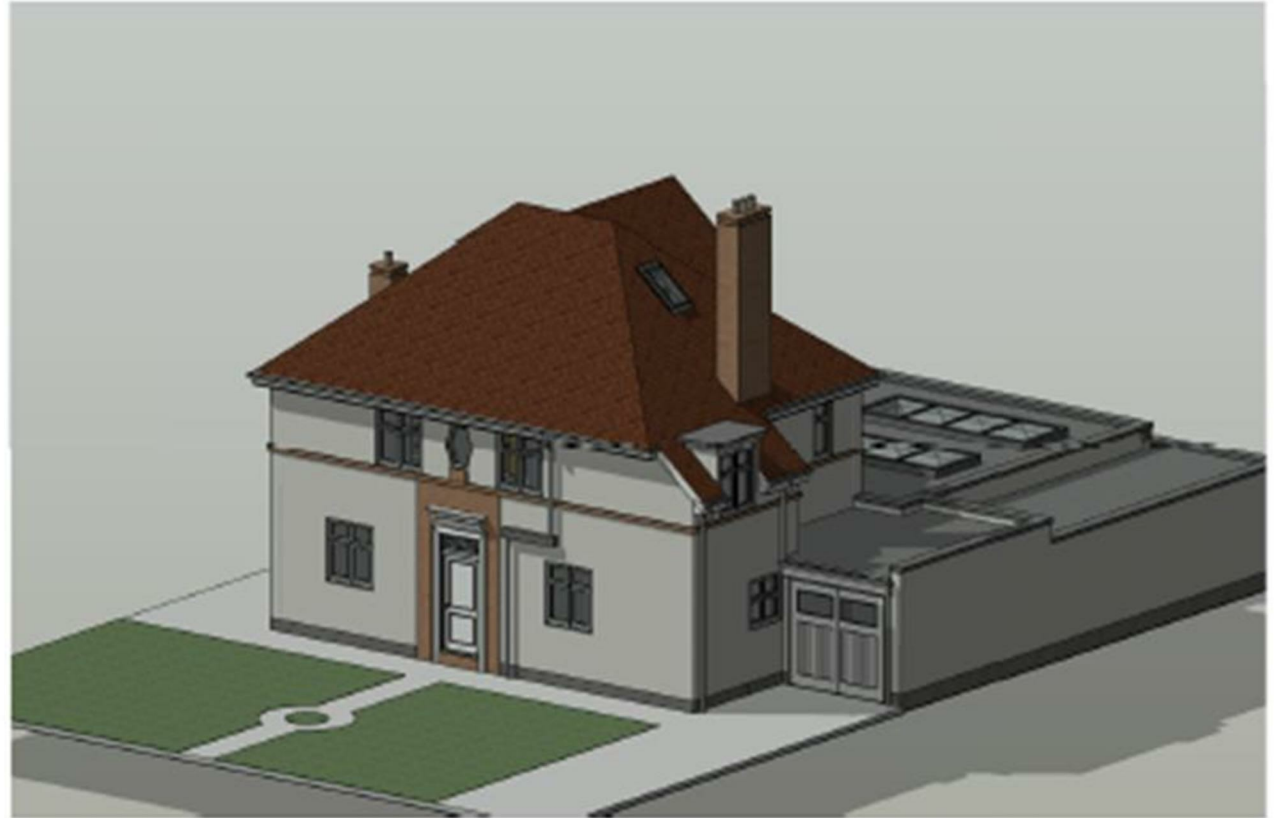
Proposed 3D Front View

Planning Permission Reference 22/03959/FUL